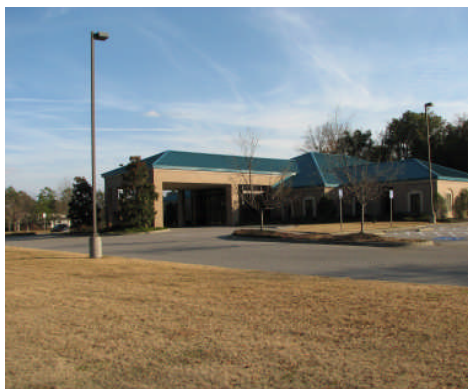
Francis Marion University Education Foundation and Non-Profit Consortium

The NESAs team recently relocated to newly acquired and renovated office facilities in the Francis Marion University Education Foundation and Non-profit Consortium building located on Palmetto Street across from FMU. Phone numbers, shipping and mailing addresses will remain the same.